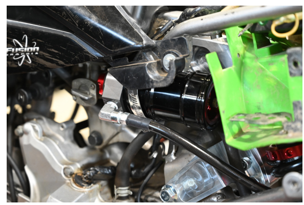
10. Install shock with reservoir hose pointing towards the rear fender.