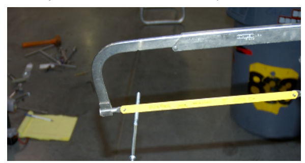
15. Carefully cut brake rod (we recommend using a hack saw) leaving 3/4" of threads then install the brake rod adapter as shown.