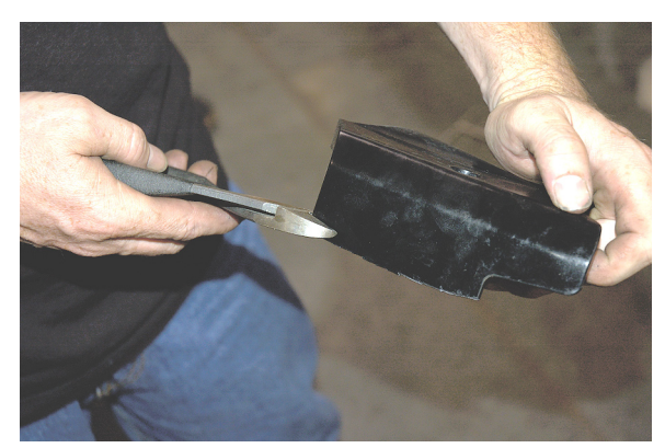
12. Trim counter shaft sprocket cover for shock tower clearance.