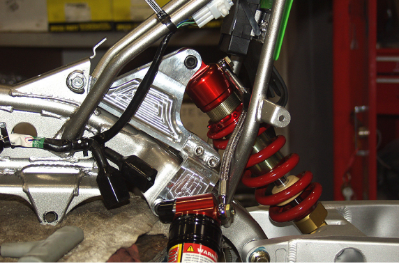
9. Install billet shock tower