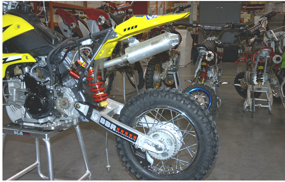
13. Install rear wheel.