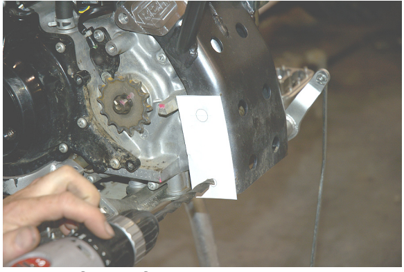
6. Drill frame for chain roller using the provided template to locate the hole (Non-L models only).