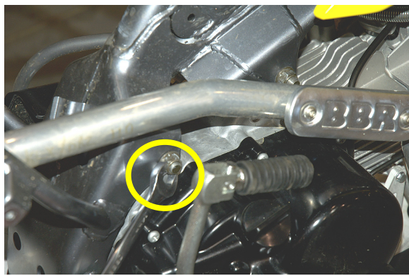
8. Remove center engine bolt.