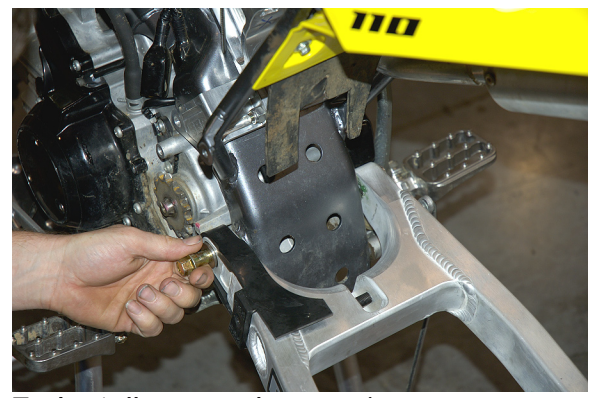
7. Install new swingarm (we recommend greasing the pivot bearings with a high quality water proof grease).