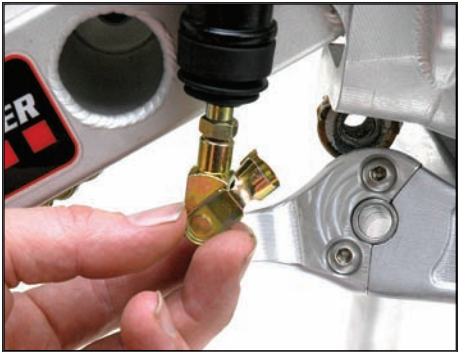
11. Unsnap the clevis pin from the bottom of the brake reservoir.