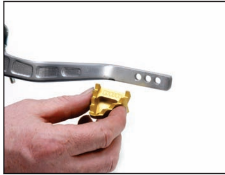
10. Install brake pedal tip in desired location. BBR recommends using a thread lock here also.