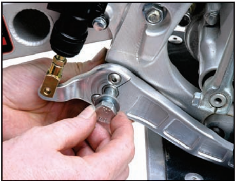
13. Install the brake pedal and hook the bottom end of the brake pedal spring on the pedal.