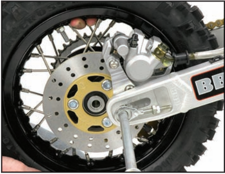
9. Install rear wheel. Use care to insure that the rotor slides between the brake pads and the wheel spacers stay in place.