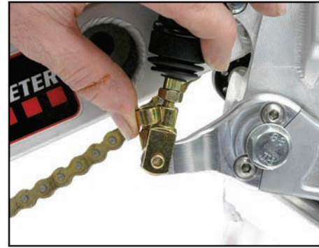
15. Install clevis pin from the back and snap into place