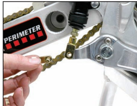
14. Adjust the clevis to line up with the brake pedal.